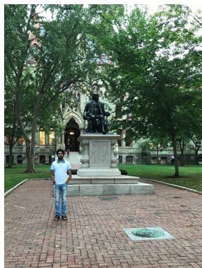
Figure 5.5(a): Front View