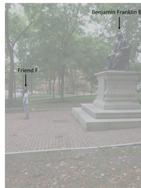
Figure 5.5(b): Side View